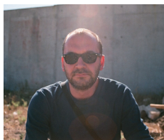
Tania Bruguera (b. 1968, Cuba)