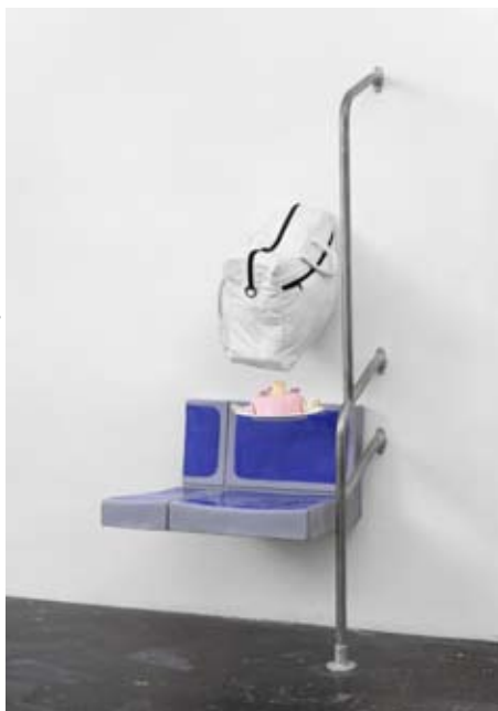
Urs Fischer, The Lock , 2007. Cast polyurethane, steel pipes, electromagnets, 72 1/2 x 29 1/2 x 21 1/4 in (184 x 75 x 55 cm). Courtesy the artist; Gavin Brown's enterprise, New York; Galerie Eva Presenhuber, Zürich; and Sadie Coles HQ, London. Collection of Amalia Doyan.

An engineer of imaginary worlds, Urs Fischer has previously created sculptures in a rich variety of materials including such unstable substances as melting wax and rotting vegetables. In a continuous search for new plastic solutions, Fischer has in the past built houses out of bread and given life to robots and animated puppets; he has dissected objects or, alternatively, blown them out of proportion in order to reinvent our relationship to them. By digging up floors and carving massive holes in gallery walls, Fischer has explored the secret mechanisms of perception, combining the immediacy of Pop art with a neo-Baroque taste for the absurd.