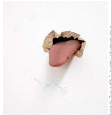
Urs Fischer, Noisette , 2009. Mixed mediums, dimensions variable. Courtesy the artist; Gavin Brown's enterprise, New York; Sadie Coles HQ, London; and Galerie Eva Presenhuber, Zürich.

For his first solo presentation in an American museum, Fischer will take over all three of the New Museum's gallery floors to create a series of environments featuring towering aluminum sculptures, objects that appear to melt, and a labyrinth of silkscreened chrome steel boxes that will turn an entire floor into a dazzling cityscape of mirrored images. Marking the first time the New Museum building will be devoted to one single artist, "Urs Fischer: Marguerite de Ponty" will be on view from October 28, 2009 through February 7, 2010 .