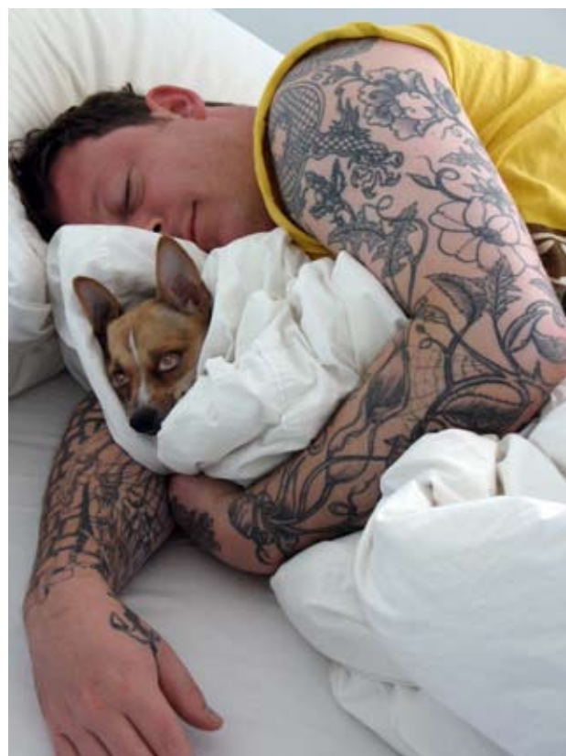
Urs Fischer, self portrait, The Heart of the Ocean, May Yohe & Putnam Strong, Zero Year Curse, Tavernier Blue, Hope Diamond , 2006, from a suite of three framed prints. Epson ultra chrome inkjet print on Enhanced Matte paper in a frame of glass-fiber-reinforced plaster, 31 1/2 x 24 1/4 x 1 1/2 in (79 x 62 x 3.5 cm). Courtesy the artist; Gavin Brown's enterprise, New York.