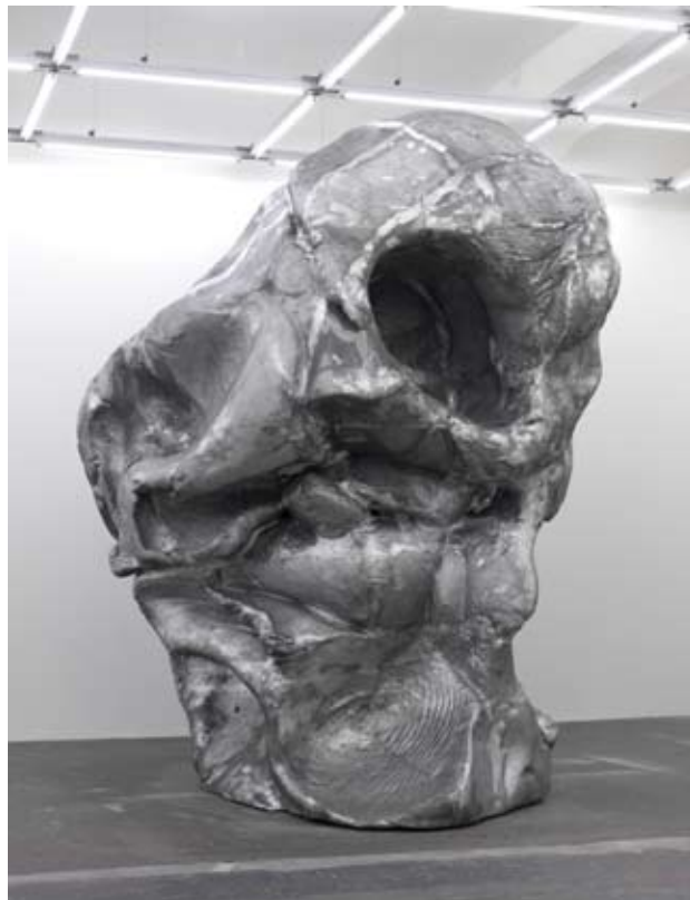
Urs Fischer, Marguerite de Ponty , 2006–08. Cast aluminum and steel, 157 1/2 x 110 1/4 x 102 3/8 in (400 x 280 x 260 cm). Courtesy the artist; Gavin Brown's enterprise, New York; Sadie Coles HQ, London; and Galerie Eva Presenhuber, Zürich.

Urs Fischer was born in Zurich in 1973, and currently lives and works in New York City. He was included in "Unmonumental," the New Museum's inaugural exhibition for the opening of the SANAA-designed building in 2007. Fischer's work has been the subject of several solo exhibitions in European museums, including the Kunsthaus in Zürich; the Museum Boijmans Van Beuningen in Rotterdam; and the Centre Pompidou in Paris. His work was also included in the 2006 Whitney Biennial.