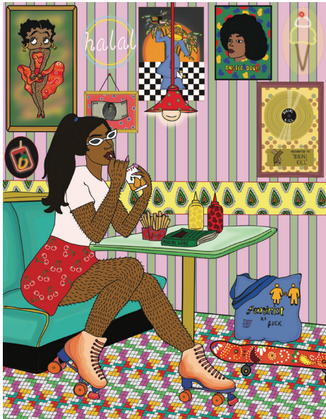
Ayqa Khan, International Women's Day, 2015. Print, 9 × 12 in (22.9 × 30.5 cm).

New York, NY...Since its founding in 1977, the New Museum has been dedicated to championing art as a vital social force. This fall, the New Museum's DEMOCRACY-themed R&D Season presents a series of public programs and conversations around matters of representation, suppression, constitutional protection, political identity, and activism.