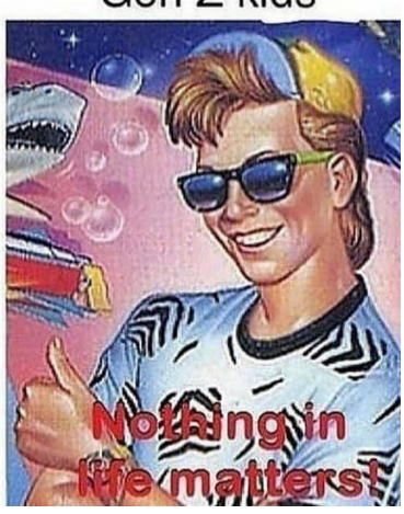
Nothing in Life Matters: Nihilism, 2018. Meme found on Politigram.

New York, NY... Rhizome, the leading born-digital art and culture organization and longtime affiliate of the New Museum, is thrilled to announce details of its 2019–20 program. Building on the success of the "Net Art Anthology" initiative and the exhibition "The Art Happens Here: Net Art's Archival Poetics," which is beginning a national tour, Rhizome introduces a new research-based program structure to begin this fall. In this new model, Rhizome's full range of activities—publishing, commissioning, digital preservation, events, and exhibitions—will be aligned with urgent questions animating digital culture.